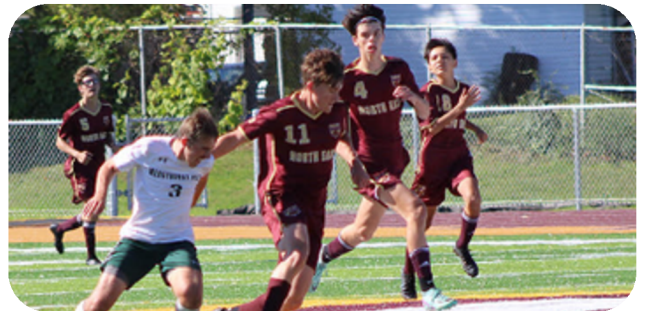
The North East boys soccer team headed to round two of the District 10 playoffs.