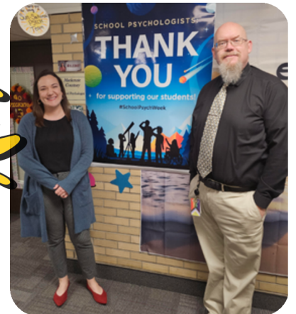
Happy National School Psychologist Week! We are fortunate to have two amazing school psychologists out here in North East.