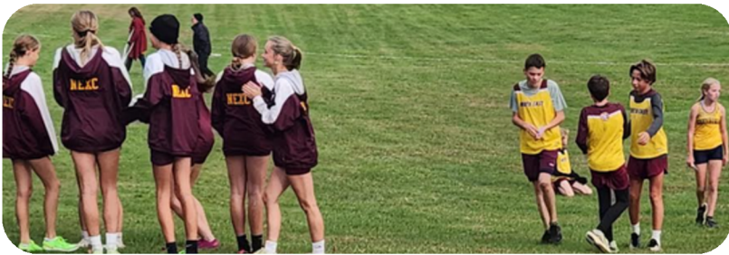
North East Cross Country (Middle & High School Students)